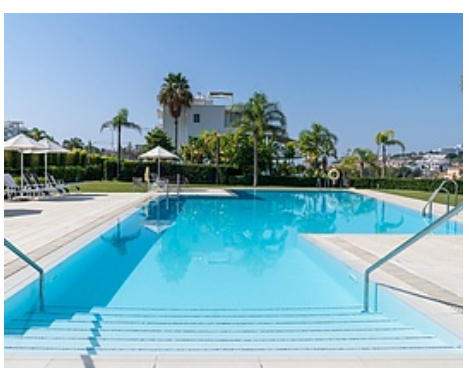
minimum minimum minimum